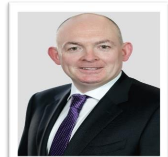
Rossa Fanning SC Attorney General