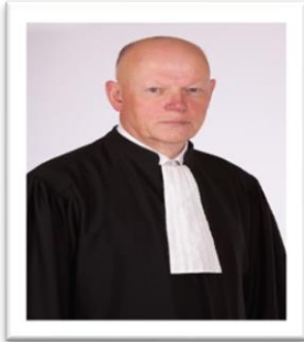
The Hon. Mr. Justice Donal O'Donnell Chairperson, Chief Justice