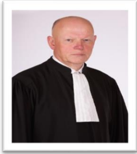
The Hon. Mr. Justice Donal O'Donnell Chairperson, Chief Justice