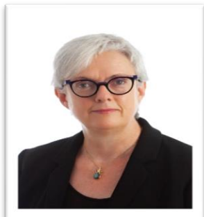
Sara Phelan SC Chairperson of the Bar Council