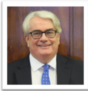
The Hon. Mr. Justice Frank Clarke Chairperson, Chief Justice