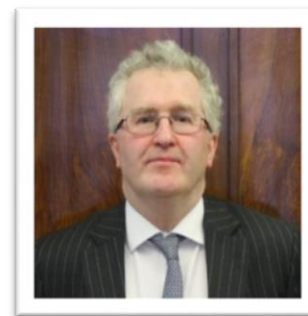
Seamus Woulfe SC Attorney General