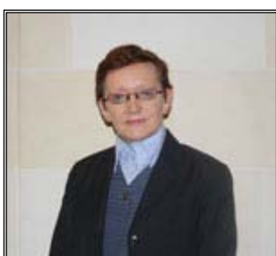
Ms. Máire Whelan SC Attorney General