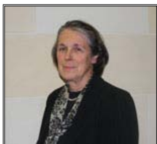
The Hon. Mrs. Justice Susan Denham Chairperson, Chief Justice